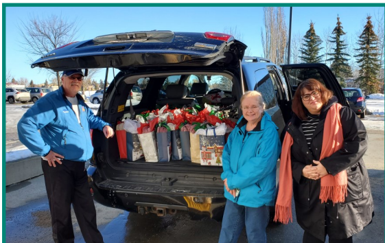
Thank you to the Spruce Grove Rotary Club for donating 49 gift bags for the moms at WINGS this Christmas.